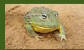
Bullfrog: by Mark Marshall

Grasslands in Nelson Mandela Bay usually occur in association with Fynbos or Thicket. Grassy Fynbos stretches from Bethelsdorp towards the Van Stadens Berg, extending across Port Elizabeth on flat plains with deeply incised valleys. The vegetation type is dominated by Rooigras ( Themeda triandra ) which is an indicator of an undisturbed grassland. The fynbos present in the grassland largely comprises various bulbs and Erica species. Seasonal vleis are unique features within grassy fynbos as they provide habitat for the critically endangered Southern Bull Frog ( Pyxicephalus adspersus ).