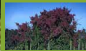
Spekboom: Paul Martin

The Thicket Biome occurs mostly on deep red loamy soils in the northern and eastern areas of the NMB. Thicket grows at the junction of the summer and winter rainfall regions. It is big game country and consists of a diverse impenetrable mass of spiny, evergreen shrubs. Typical thicket species include Spekboom ( Portulacaria afra ), and various Aloe species. Spekboom shows exceptionally high carbon dioxide storage ability, and is considered an important plant to buffer the effects of climate change. It is also a favourite food of elephants. Once cleared thicket is gone forever and cannot be re-instated.