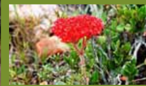
Crassula: Wesley Barington

The Nama Karoo Biome is mostly found in the drier interior areas of Nelson Mandela Bay on shallow well drained soils. The vegetation comprises various succulent species, intermixed with stunted trees, geophytes and annual forbs. Nama Karoo species, typically, Aloe striata, various Crassula and Euphorbia species, have adapted to growing in low moisture conditions and extreme temperature ranges.