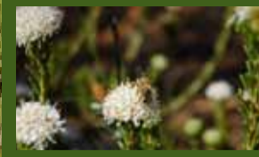
Boegoe: Wesley Barington

The Fynbos Biome reaches the eastern edge of its distribution range in Nelson Mandela Bay (NMB) where it is located in the western and mountainous areas of the city. Fynbos is a winter rainfall vegetation type, found on shallow nutrient poor sandstone soils. The vegetation comprises low growing bushes, mostly with very small leaves and is characterized by an abundance of Erica, Restio and Protea species. The genus Agathosma, especially Agathosma species, commonly known as Boegoe, is typical to coastal fynbos. This aromatic species is well known for its medicinal properties in terms of curing a variety of stomach ailments, and is strong smelling with pungent odor when crushed between the fingers. Agathosma plants are generally pollinated by insects. Their seeds are dispersed by wind and "planted" beneath the soil by ants.